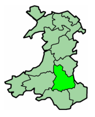
Brecknockshire , Wales