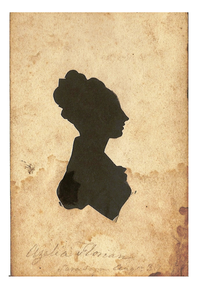
Azelie (Azelia) Florian, later in life, at Saratoga, NY probably in August 1839